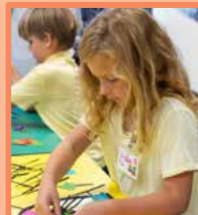
Worship Arts Camp