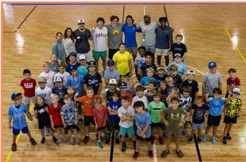
Whiffle Ball Sports Camp

We're so grateful to have had such a wonderful group of young people to join us this summer during our camps. We hope to see you all again next year!