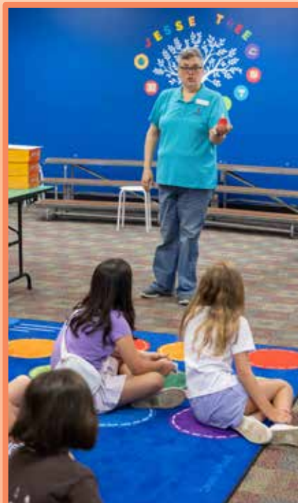
Worship Arts Camp