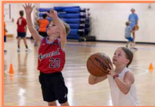
Basketball Sports Camp