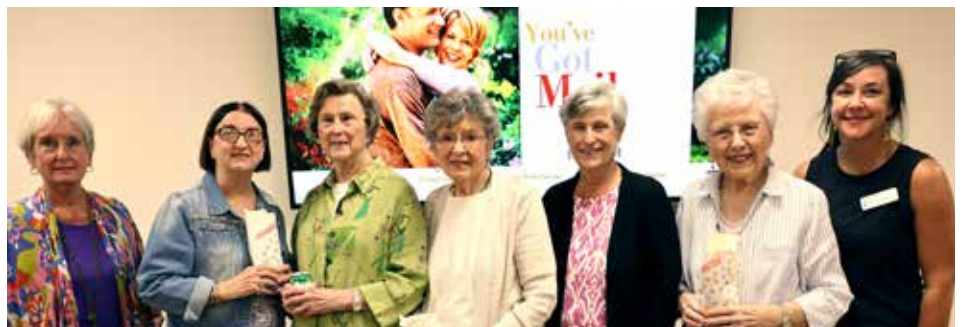
Movie of the month attendees recently enjoyed the romantic comedy, “You’ve Got Mail.”

The way our 55 Forward group serves not only our church, but our community, makes my heart swell. There are various Bible studies, book clubs, and exercise classes our members enjoy. Many in our 55 and older gang are respite volunteers, Harbor volunteers, and take an active part