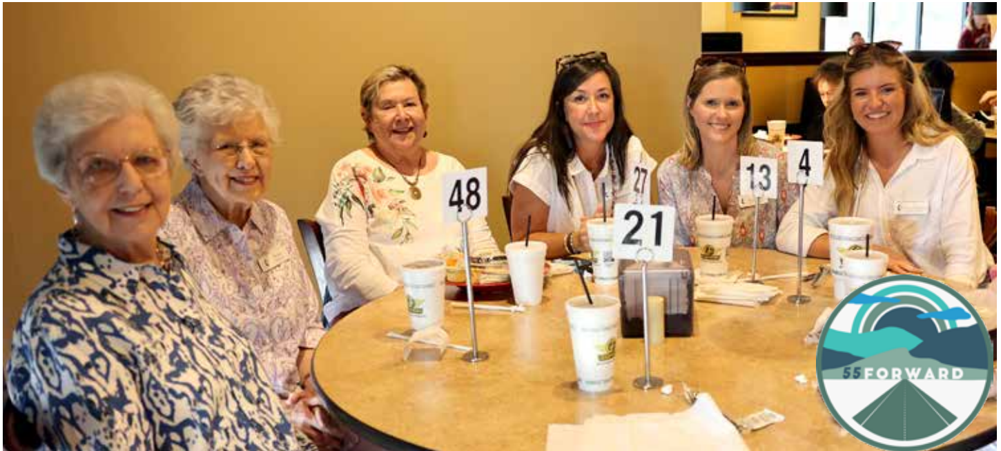
55 Forward group members enjoy fellowship with a few “non-members” recently at a local restaurant.