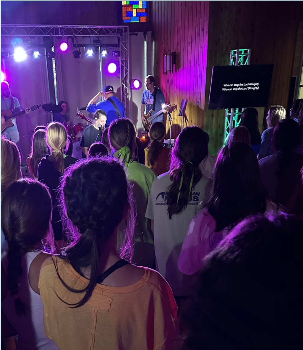
Youth in praise and worship during Oakwood Summer Camp 2023.