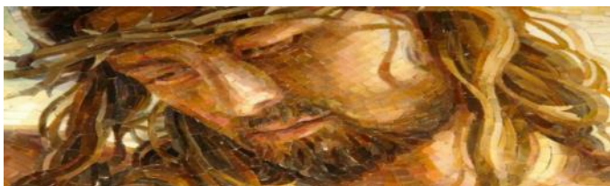
The Most Holy Body and Blood of Christ

On-site at FUMC you can help with cleaning, organizing, and some small repairs. There will also be a free car wash. We will close the day with a team to flip the fellowship hall from a dining set up with tables and chairs to the worship set up for The Bridge worship service.